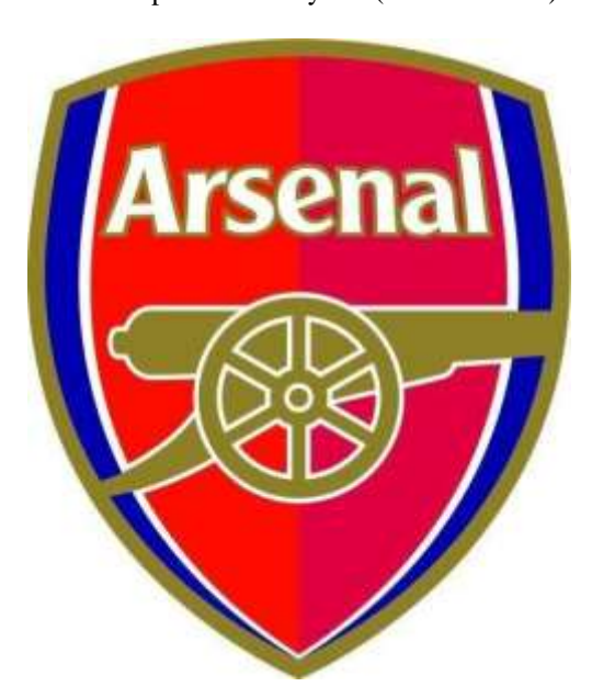
Class 32: Non-alcoholic, non-carbonated beverages; mineral and aerated waters and other nonalcoholic drinks; fruit drinks and fruit juices; syrups and other preparations for making beverages; beer, ale and porter; thirst-quenching drinks in liquid, powder and concentrated form; fruit-flavoured soft drinks and powder for making the same; fruit-

14151 The Arsenal Football Club Public Limited Company has applied on 8<sup>th</sup> March, 2017 for Registration of a Trade Mark in respect of the device below in the following class with claims for the colours Red (Pantone 186C), Red (Pantone 200C), Royal Blue, White and Gold. The outer edge of the shield is gold. The left and inner edges of the shield are royal blue. The gun is gold with an outer rim of white. The word "ARSENAL" is white with an outer edge of gold. The background of the shield is predominantly red (Pantone 186C) and red (Pantone 200C):