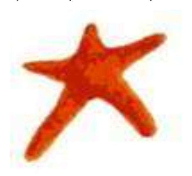
Class 5: Pharmaceuticals and medical preparations and substances; vaccines; pharmaceutical preparations and substances for the prevention and treatment of disorders and diseases in, generated by or acting on the central nervous system; pharmaceutical preparations and substances acting on the central nervous system; central nervous system stimulants; pharmaceutical preparations and substances for the prevention and treatment of psychiatric and neurological disorders and diseases; pharmaceutical preparations and substances for the prevention and treatment of dementia, Alzheimer's disease and disorder, dizziness, seizures, stroke, depression, cognitive impairment, cognitive disorders and diseases, mood disorders, psychosis, anxiety, apathy, epilepsy, Lennox-Gastaut syndrome (LGS), sclerosis, porphyria, Huntington's disease and disorder, insomnia, Parkinson's disease and disorder, falls, movement disorders and diseases, schizophrenia, bipolar disorder and disease, ADHD, cancer, migraine, pain, alcoholism and dependency; preparations, substances, reagents and agents for diagnostic and medical purposes.

14082 H. Lundbeck A/S has applied on 3<sup>rd</sup> February, 2017 for Registration of a Trade Mark in respect of the device below with a priority filing date of 17<sup>th</sup> August, 2016 in the following class: