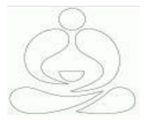
Class 30: Ground and whole bean coffee; coffee-based beverages; cocoa; chocolate-based beverages; tea and herbal tea; tea and herbal tea-based beverages; coffee-based beverage mix; espresso-based beverage mix; chocolate-based beverage mix; tea-based beverage mix; herbal tea-based beverage mix; frozen confections, namely, ice cream, ice milk, frozen yogurt, frozen confections with tea, herbal tea and/or fruit flavoring; flavorings, other than essential oils, for beverages; vanilla flavoring; chocolate and candy confections; baked goods, namely, muffins, scones, biscuits, cookies, pastries and breads; sandwiches; prepared meals consisting primarily of pasta; prepared meals

17286 TEAVANA CORPORATION has applied for Registration of (1) Trade Mark in respect of the following classes: