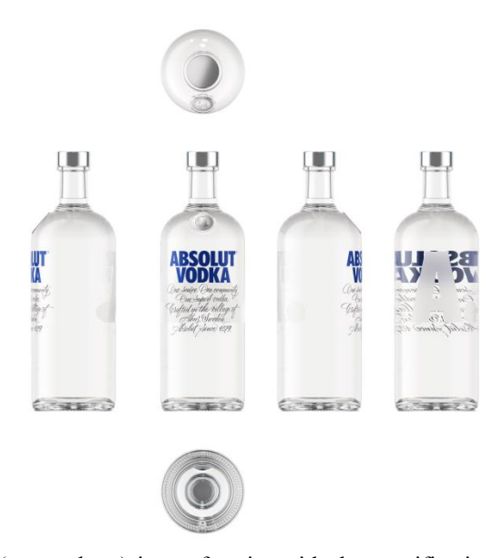
Class 33: Alcoholic beverages (except beer) in conformity with the specifications of the "Svensk vodka/Swedish vodka"

In accordance with Rule 19 and section 51 of the Trade Marks Act, 2013 any person may, within three months of the publication of the application for registration of the trade mark give notice in duplicate to the registrar indicating opposition to the registration of the Trade Mark to which the application relates.